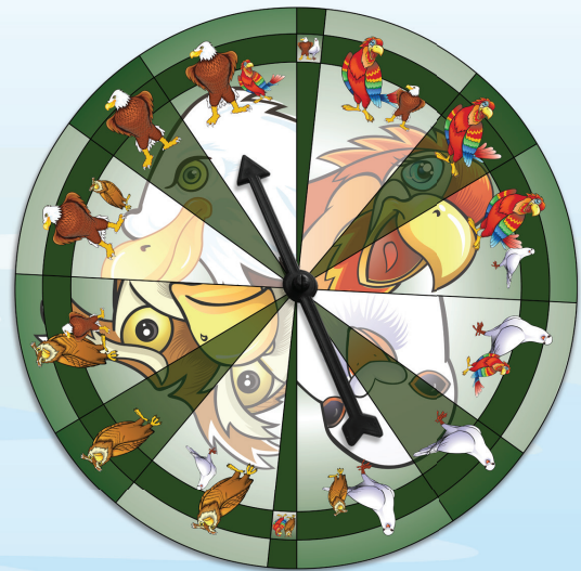
The Wheel of Style Exercise