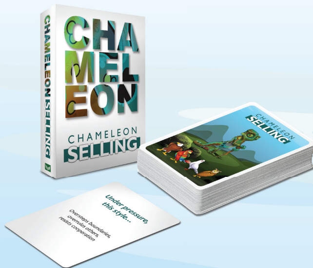
Chameleon Selling Style Card Exercise

Chameleon Selling engages sales professionals in a process that develops a better understanding of one's selling style, awareness of the styles of prospects and customers, improved communication skills, and a commitment to improve sales performance both as individuals and as a team.